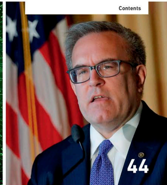
New face, same policies: former coal lobbyist Andrew Wheeler has succeeded Scott Pruitt as head of the Environmental Protection Agency.