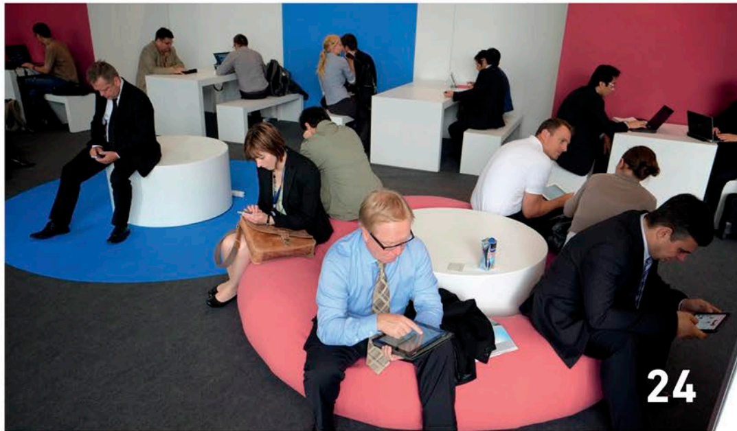
Virtual world: more and more aspects of our lives are dominated by screens, algorithms and data. Digitalisation could be a boon for climate action, but there are risks too – not least in terms of electricity consumption.